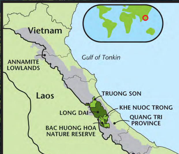
Map showing Khe Nuoc Trong