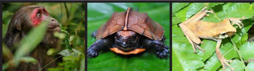
Stump-tailed Macaque, Keeled Box Turtle, Orlov's Treefrog, just some of the endangered and critically endangered species